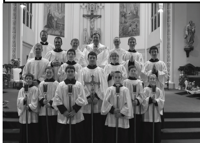
The Christmas Eve Ceremonies Crew! Great job fellas!!!